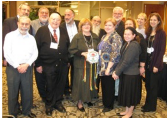
New Jersey Contingent